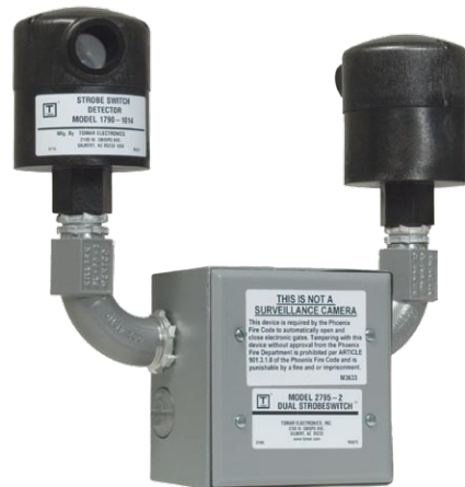
2795-2 Dual STROBESWITCH™ Assembly