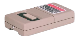
**Hand Held Tester