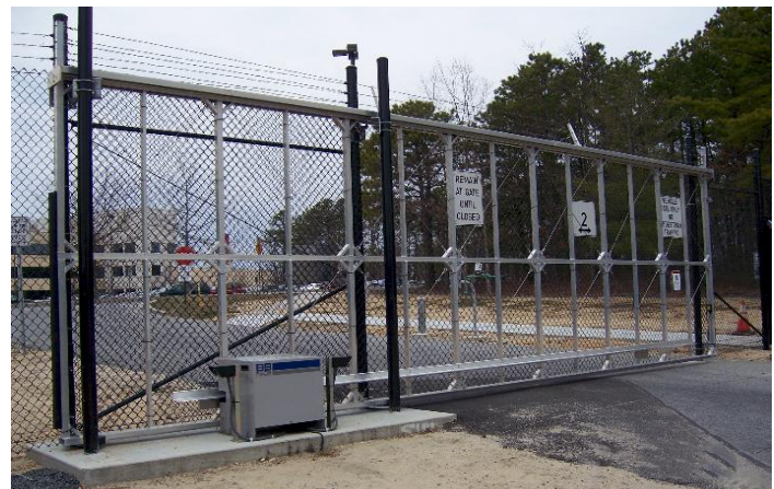
Model LXL-1543-HS High Speed

✓ ✓ ✓ ✓ ✓ ✓ ✓ ✓ 4x12 LCD 8 / 3 4 / 4 Option Option Option Option Option