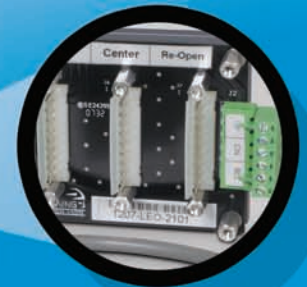
Loop rack included