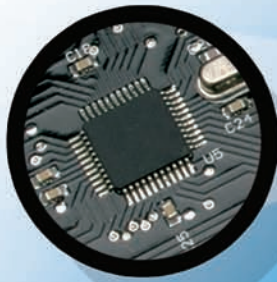
Soft-Stop / Soft-Start with intelligent Obstruction Detection