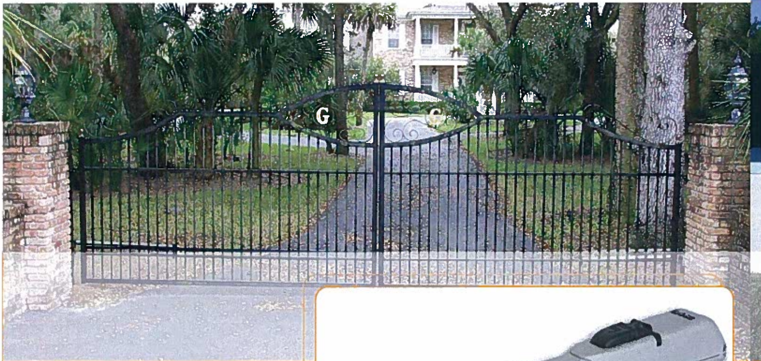
Model 415 Low voltage swing gate operator