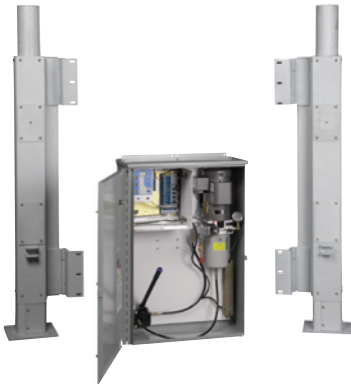
12 models: Up to 16 ft wide per leaf. 14, 18 or 30 second speed.

Ultra high security and reliability • High cycle • Large heavy gates • Utility or elegant